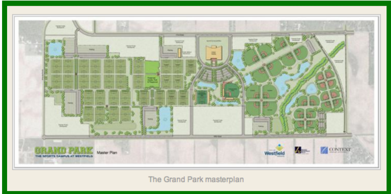
The Grand Park masterplan